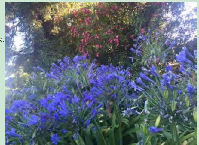
Blue Agapanthus is complemented by the pink oleander in the rear.